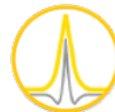
TUNABLE DIODE LASER