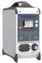
PROCESS GAS ANALYZER