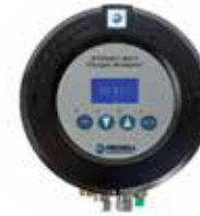
CONTINUOUS EMISSIONS MONITORING SYSTEMS