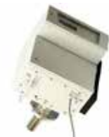
SAMPLE HANDLING SYSTEMS